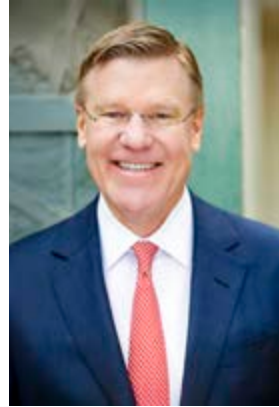
Cook Children's president and CEO

Maintaining our well-deserved reputation for integrity and ethical behavior is paramount. That's why we've updated the 2025–26 code of conduct, a clear road map for upholding the high standards we follow. It outlines our responsibilities in ethical and legal areas like patient confidentiality, working with vendors, using social media and upholding the other laws and regulations we're all required to follow.