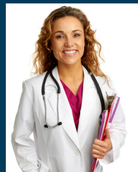
Pregúntele a su doctor