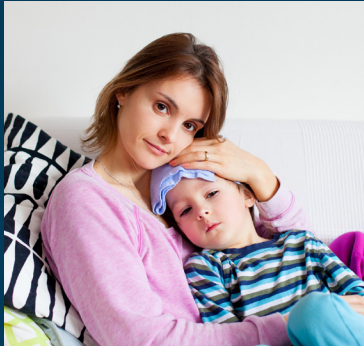
Posición de consuelo