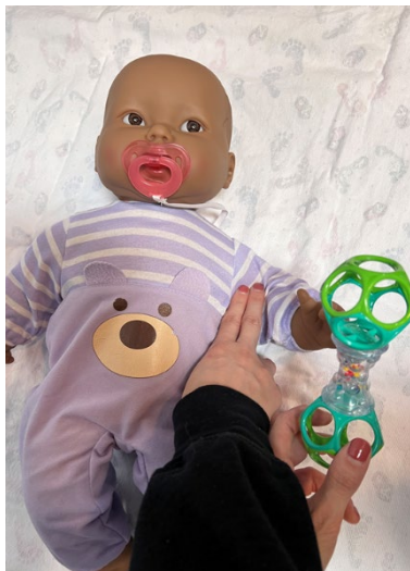
Helping infant move elbow to touch toy