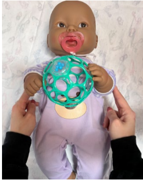
Helping infant touch a toy with both hands