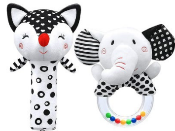
High contrast soft rattles