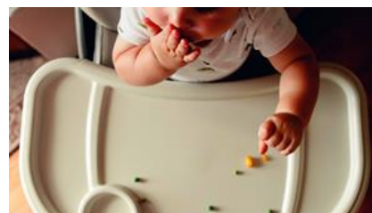
Scooping cereal into palm