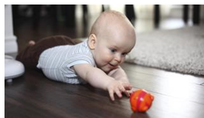
Reaching for an object with one hand