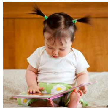
Turning pages in a book