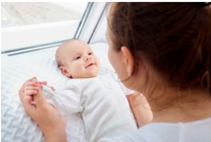
Making eye contact