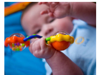
Holds rattle briefly