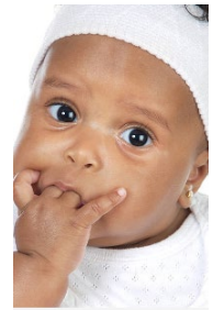
Bringing hands to mouth