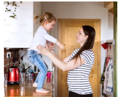
Caregiver helping child jump