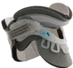
Aspen Pediatric Cervical Collar

There are two types of pediatric cervical collars: