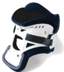
Miami J Pediatric Cervical Collar