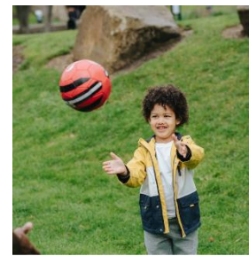
Child kicking and catching a ball